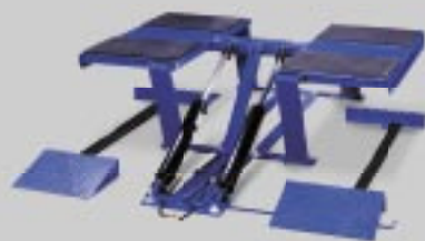
7000TL - 7,000 lbs. capacity low-rise lift