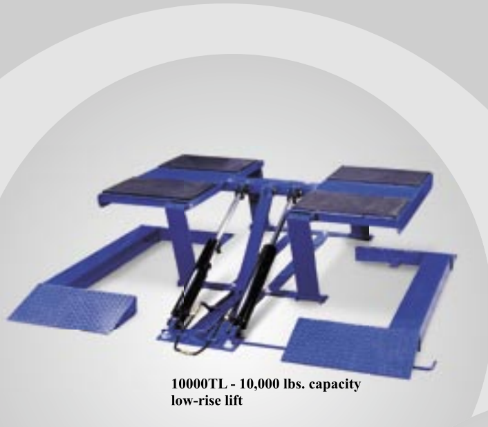
10000TL - 10,000 lbs. capacity low-rise lift