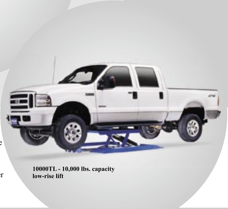
10000TL - 10,000 lbs. capacity low-rise lift